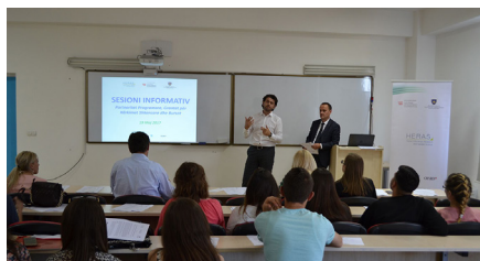
Information session at University of Applied Sciences in Ferizaj