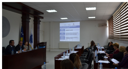
Information session at University of Mitrovica