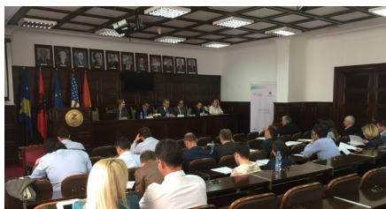
Information session at University of Prishtina

In order to provide more in-depth information about the HERAS project calls such as the Programmatic Partnership (PP), collaborative research projects, and scholarships, the HERAS team organized information sessions at all Higher Education Institutions (HEIs) regarding criteria, evaluation processes and other content aspects. The interest from the universities, management, academic staff and students was very high, there were also sessions on questions and answers where they could get more information on project calls.