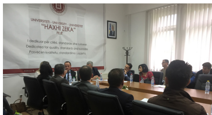
Information session at University of Peja