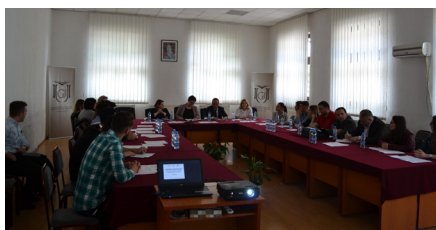
Information session at University of Gjakova