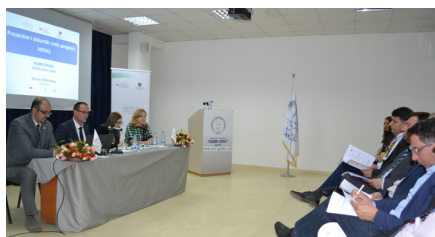
Information session at University of Gjilan